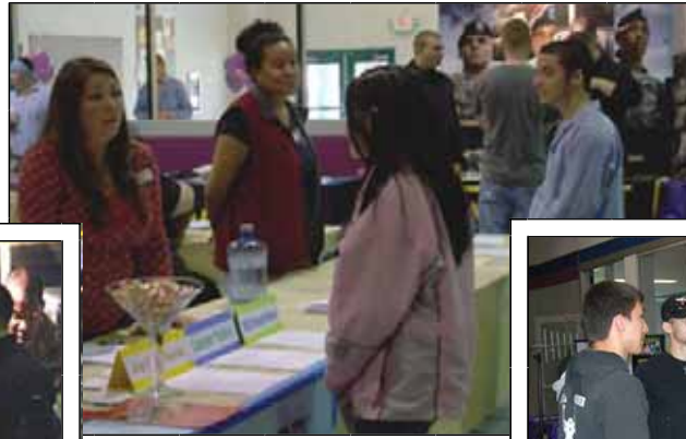
Below: Students from North Valley High School speak with representatives from Rural Metro Fire.